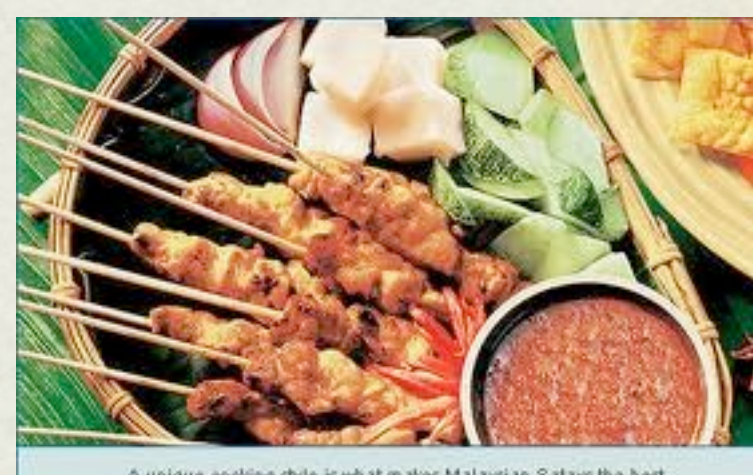
A unique cooking style is what makes Malaysian Satays the be-